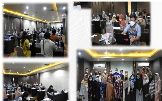
Figure 2. Making Marketing Videos Training.

In this activity, representatives of the training participants were asked to make an interesting video highlighting the uniqueness of their area, namely Nateh Village. They introduced the natural potential such as rivers, beautiful mountains, and unspoiled caves which are an attraction for tourists. The training was carried out directly by the South Kalimantan PKM TIM with officials and the Nateh village community at the Qianna Inn Barabai Hotel, Hulu Sungai Tengah Regency, South Kalimantan.