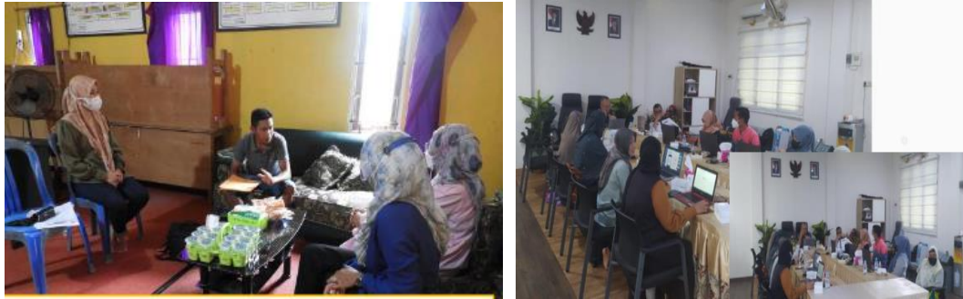
Figure 1. Observation and Creating Social Media Accounts and Websites Process.

These social media account creation training aims for all people in Nateh Village to be technologically literate. The activity also involved several students of Lambung Mangkurat University Elementary School Teacher Education Study Program in order to facilitate the service team in fostering and training the people who participated in the training activities. First, people are introduced to what social media is and its types. Then they are taught to create social media accounts for those who have smartphones, and those who don't have smartphones can use computers owned by village officials. For website creation, because the website is one of the social media that is difficult to manage by ordinary people, the management is still assisted by a service team that involves several students.